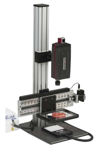
Backlighting with a clear stage platform. Often used to scan biological samples.