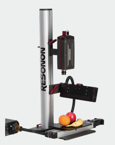
The linear stage holds the sample and translates across the field of view. Used for small samples that are easy to move.